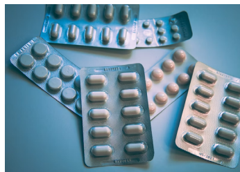
дорогие лекарства daraGEEye liKARstva expensive medication