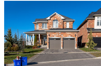
новый дом NOvyi dom a new house