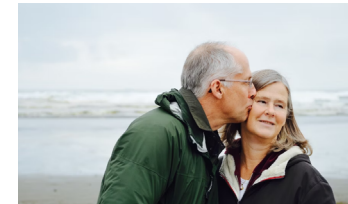
пожилые родители pazhyLYye raDEEtyeli elderly parents

О ком / чём заботится Степан? a kom / chom zaBOTitsa stiPAN Who/What does Stepan take care of?