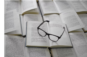
классическая литература klaSEEcheskaya litiraTOOra classic literature