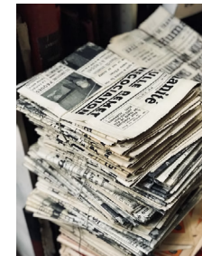
вчерашние новости fchiRASHniye NOvasti yesterday's news