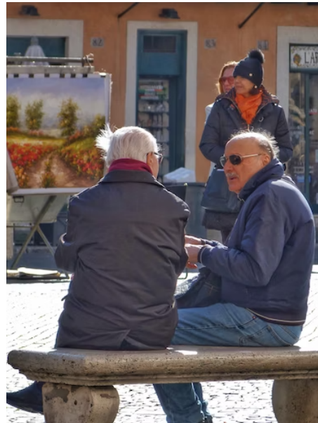
О чём они говорят? a chom aNEE gavaRYAT What are they talking about?