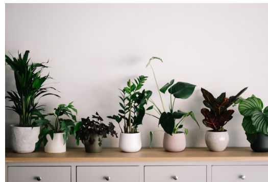
комнатные растения KOMnatnyie rasTYEniya house plants