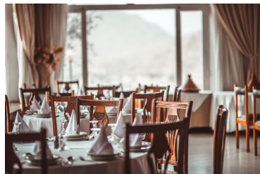
собственный ресторан SOPstvyenyi ristaRAN her own restaurant