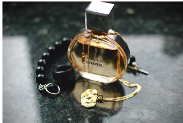
французские духи franTSOOskiye dooKHEE French perfume

Look at the pictures and answer the questions. Keep an eye on the form of the preposition as well (о/об/обо)!