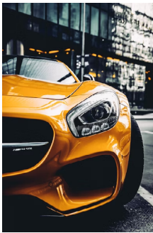
спортивная машина sparTEEVnaya maSHEEena a sport car