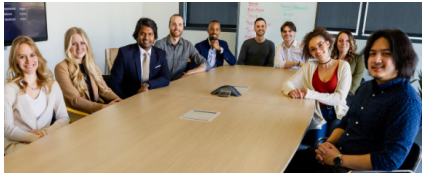
свои сотрудники svaEE saTROODniki his employees

Look at the pictures and answer the questions. Keep an eye on the form of the preposition as well (о/об/обо)!