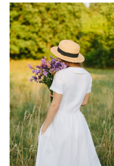
белое летнее платье BYElaye LYETnyeye PLATye a white summer dress