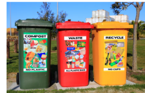
окружающая среда akrooZHAYushchaya sriDA the environment