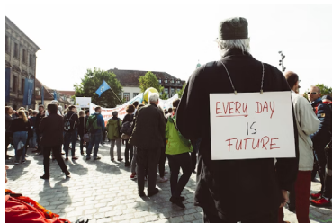
политические партии paliTEEcheskiye PARTii political parties