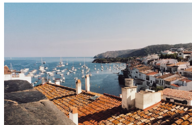
отпуск OTpoosk a vacation