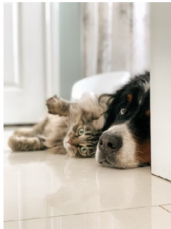
собака и кошка saBAKa i KOSHka a dog and a cat