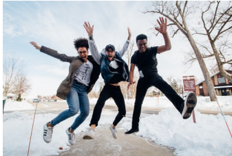
молодое поколение malaDOye pakaLYEniye the young generation

Look at the pictures and answer the questions. Keep an eye on the form of the preposition as well (о/об/обо)!