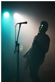
современная музыка savriMYEnaya MOOzyka modern music